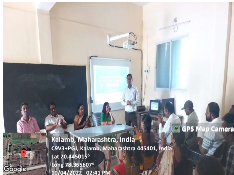
Expert Delivering Lecture on Stress Management, Date: 10/04/2022